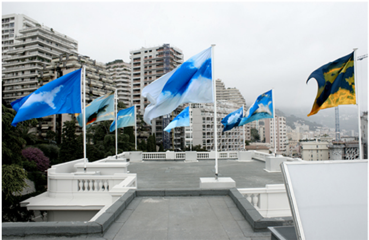
Installation view from rooftop