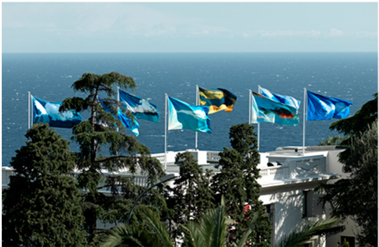
Installation view from upper street level