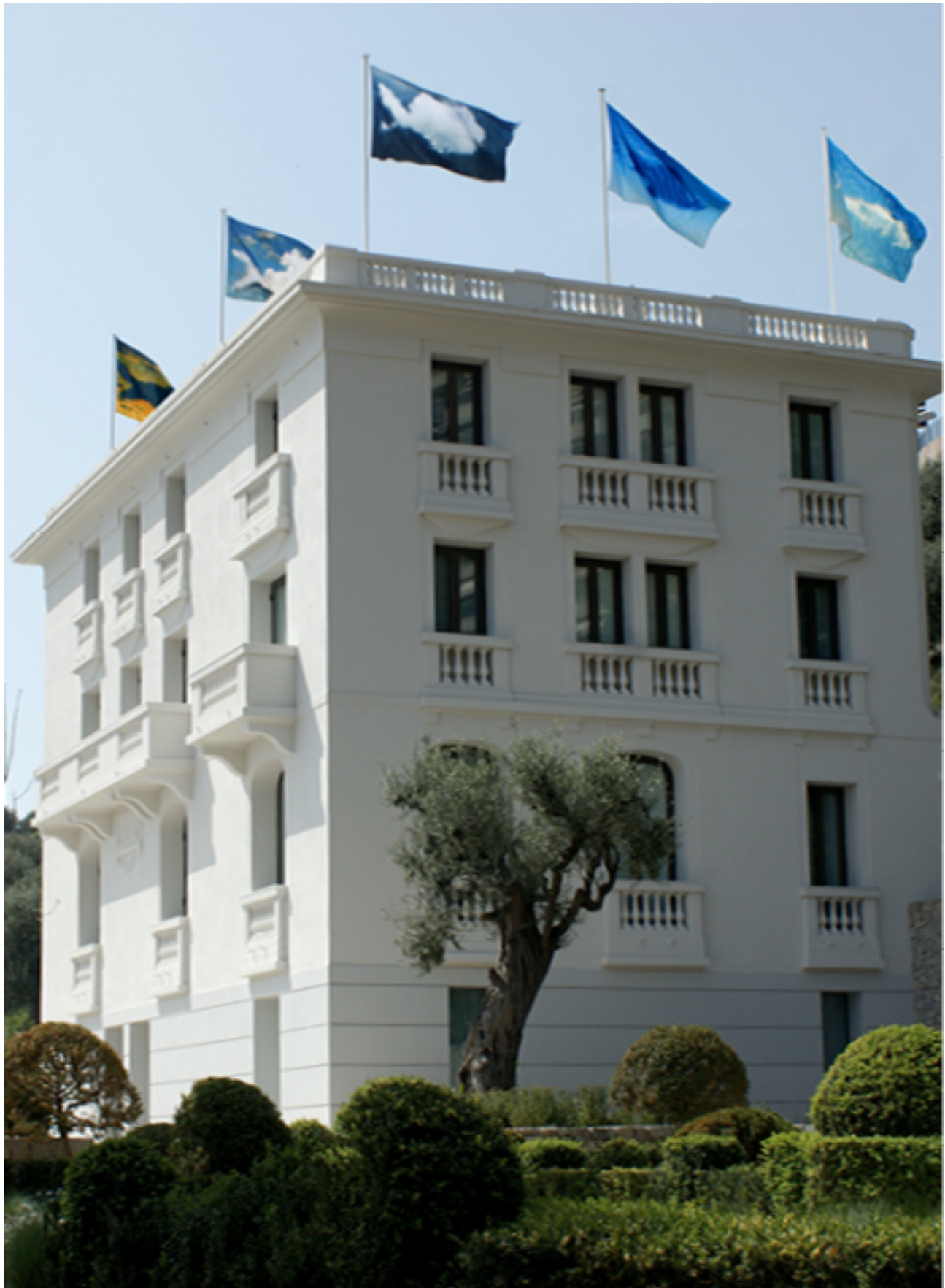
Installation view from museum gardens