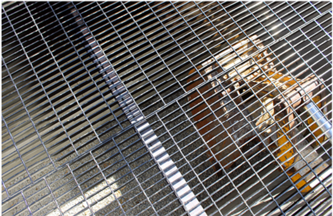
The Storm King museum building and the sculpture itself sit atop manmade hills.