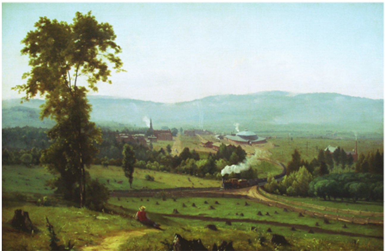
Reference: George Inness. The Lackawanna Valley . c. 1855