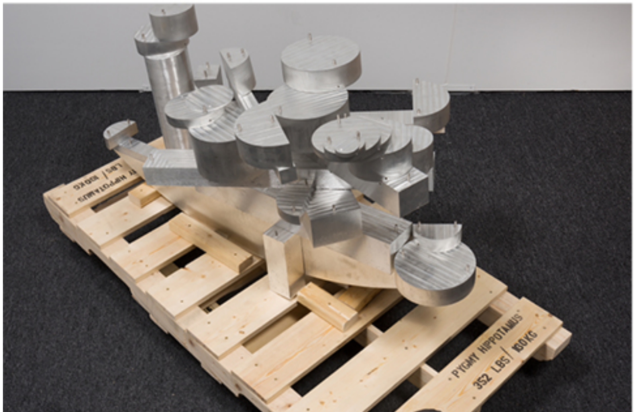
Aluminum Blocks - 352lbs. - or Pygmy Hippopotamus (West Africa.) 2014 352 pounds of aluminum, stainless steel pins, wood slat crate, stencil paint, hardware. 39 x 60 x 34 inches