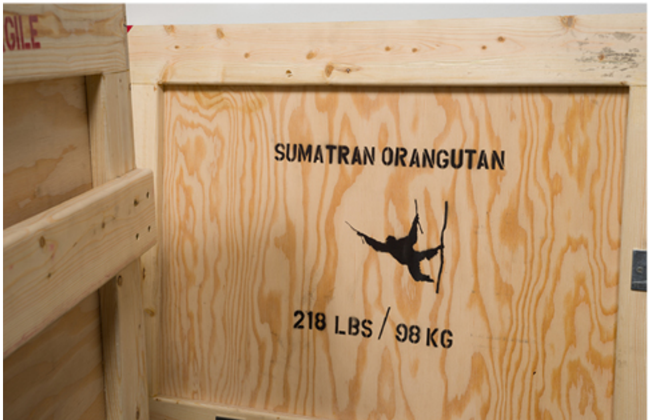
Marble Blocks - 218lbs. - or Sumatran Orangutan (Indonesia.) 2014 218 pounds of Verde Antique marble, stainless steel pins, wood crate, stencil paint, Tyvek, hardware, packing material. 27 x 35 x 24 inches