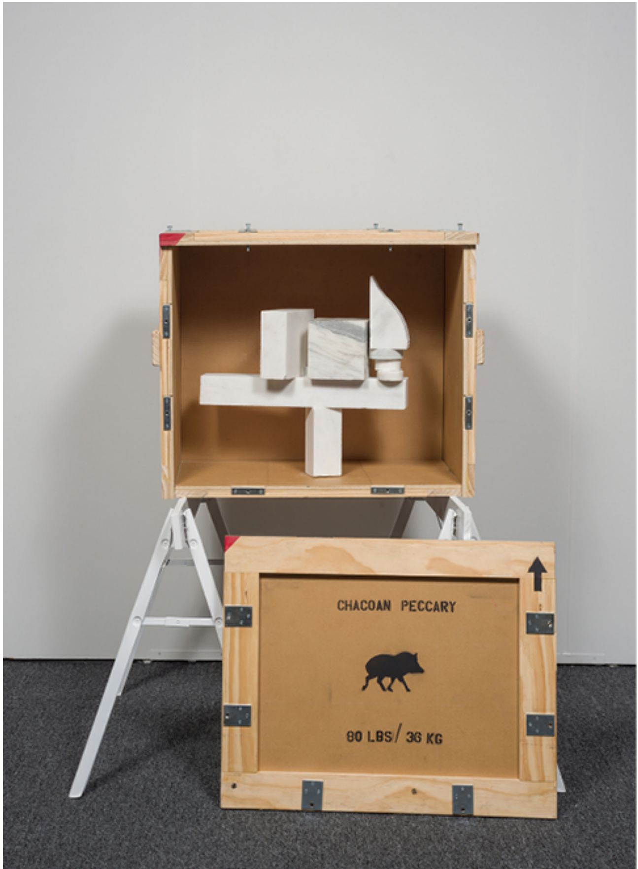
Marble Blocks - 80lbs. - or Chacoan Peccary (Bolivia.) 2014 80 pounds of Danby marble, stainless steel pins, MDF + wood crate, stencil paint, hardware, packing material. 27 x 33 x 18 inches