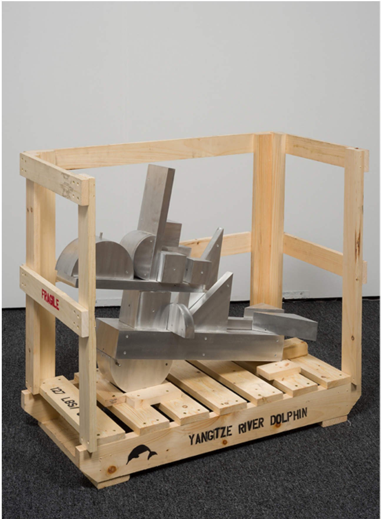
Aluminum Blocks - 127lbs. - or Yangtze River Dolphin (China.) 2014 127 pounds of aluminum, stainless steel pins, wood slat crate, stencil paint, hardware. 28 x 34 x 18 inches