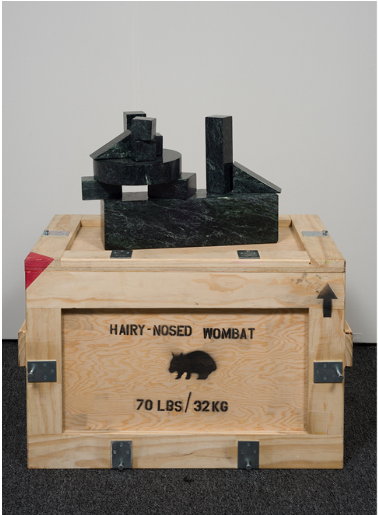
Marble Blocks - 70lbs. - or Hairy-nosed Wombat (Australia.) 2014 70 pounds of Verde Antique marble, stainless steel pins, wood crate, stencil paint, Tyvek, hardware, packing material. 24 x 28 x 18 inches