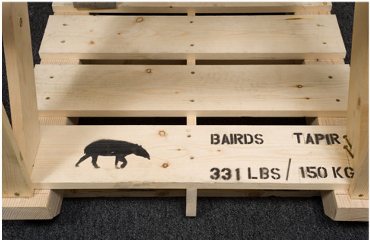
Details of: Aluminum Blocks - 331lbs. - or Baird's Tapir (Central and South America.)