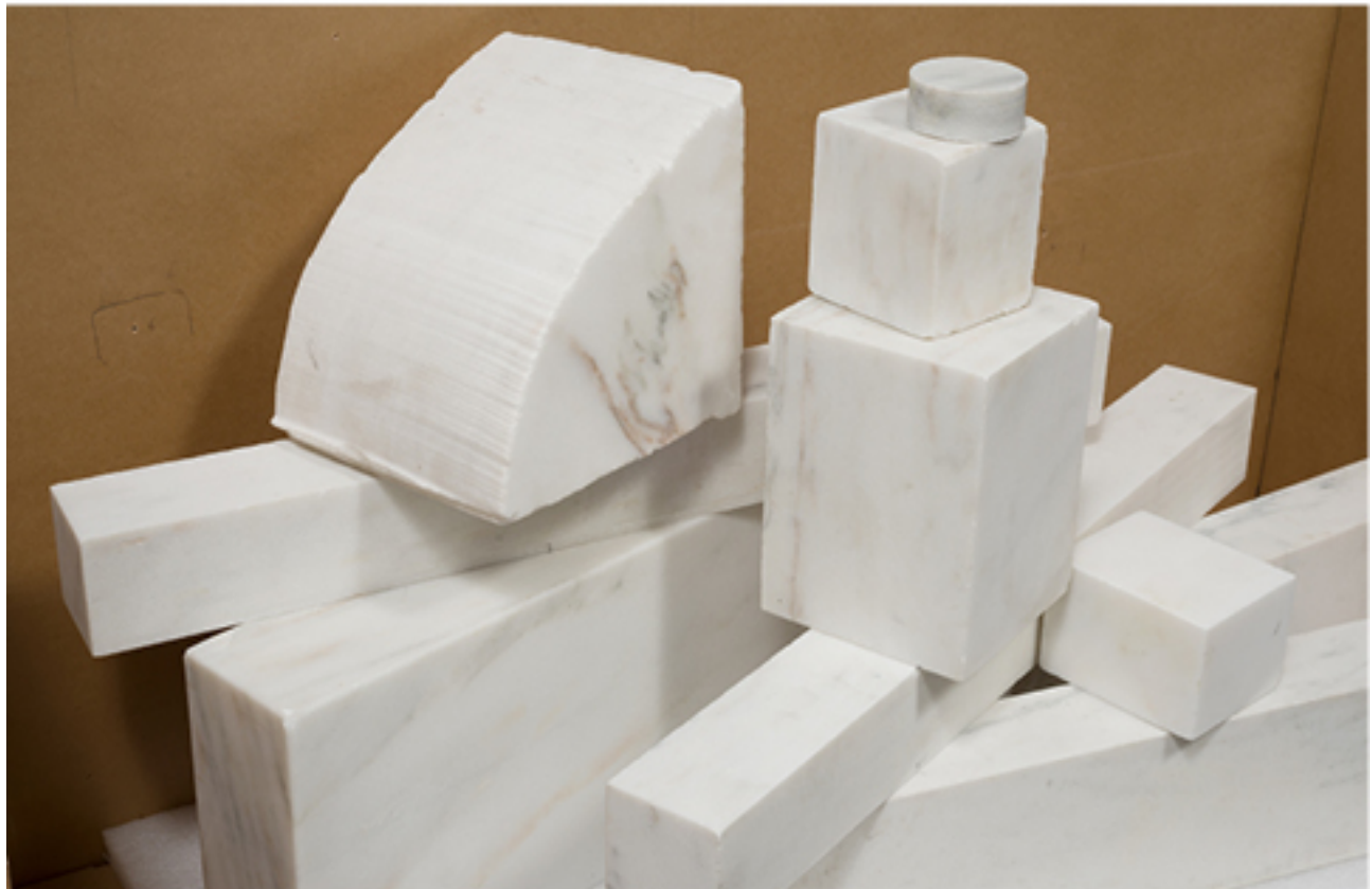
Marble Blocks - 280lbs. - or South China Tiger (China.) 2014 280 pounds of Danby marble, stainless steel pins, MDO + wood crate, stencil paint, hardware, packing material. 30 x 54 x 25 inches