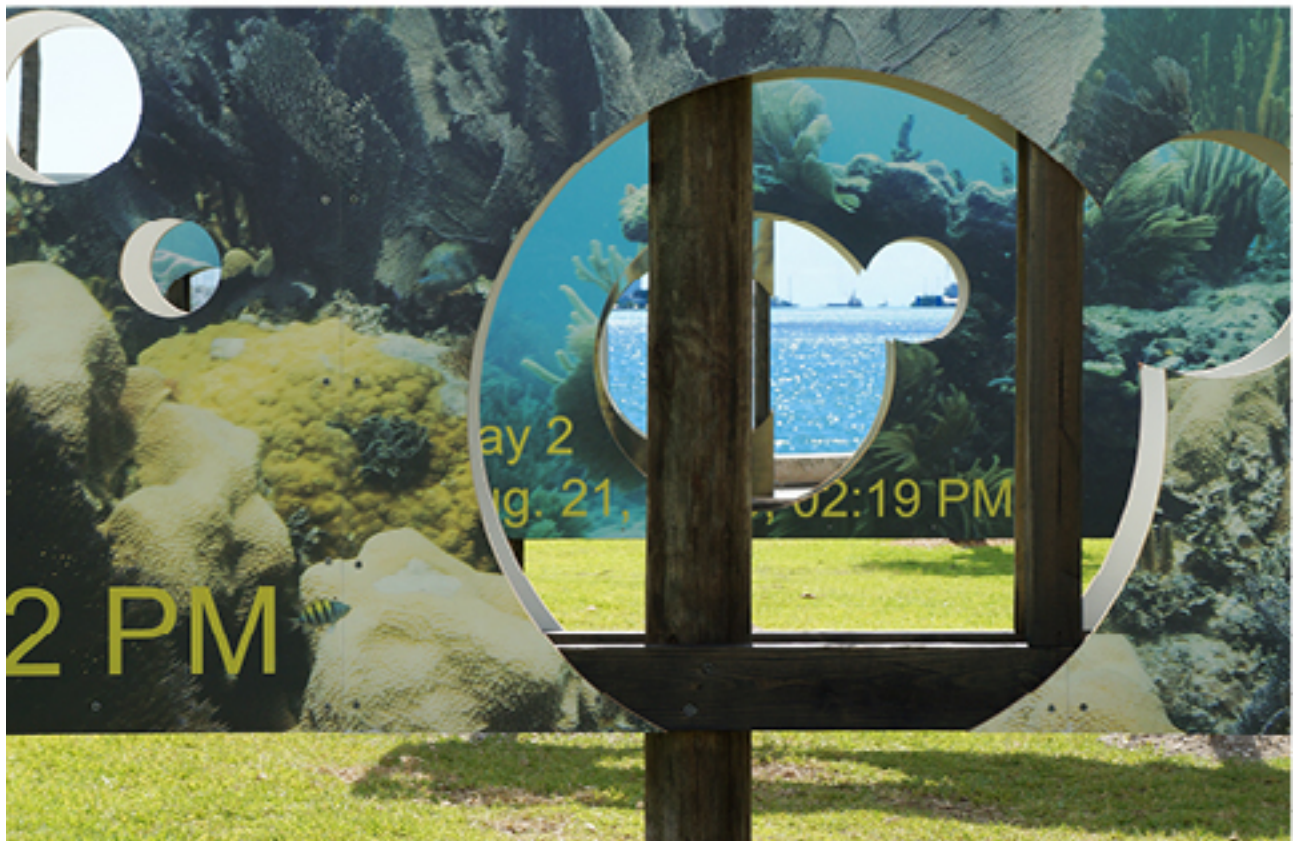
(Below) Detail looking through all three billboards towards Brewster Reef, where the billboard images were taken