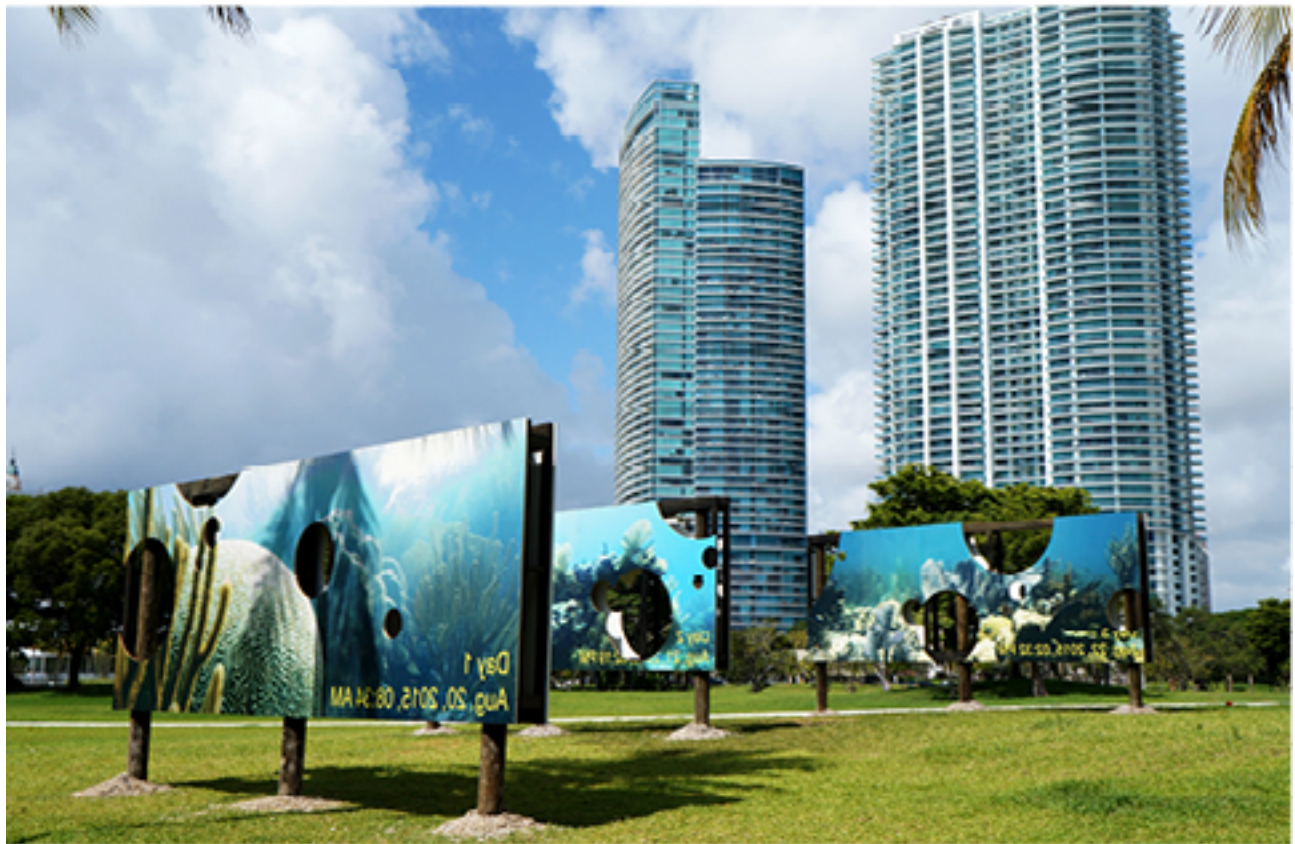
Onsite installation in Museum Park, Miami, FL