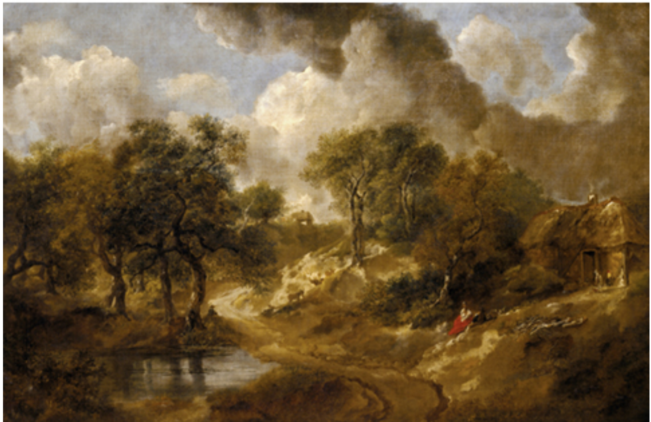
Thomas Gainsborough, "A Landscape in Suffolk," 1748