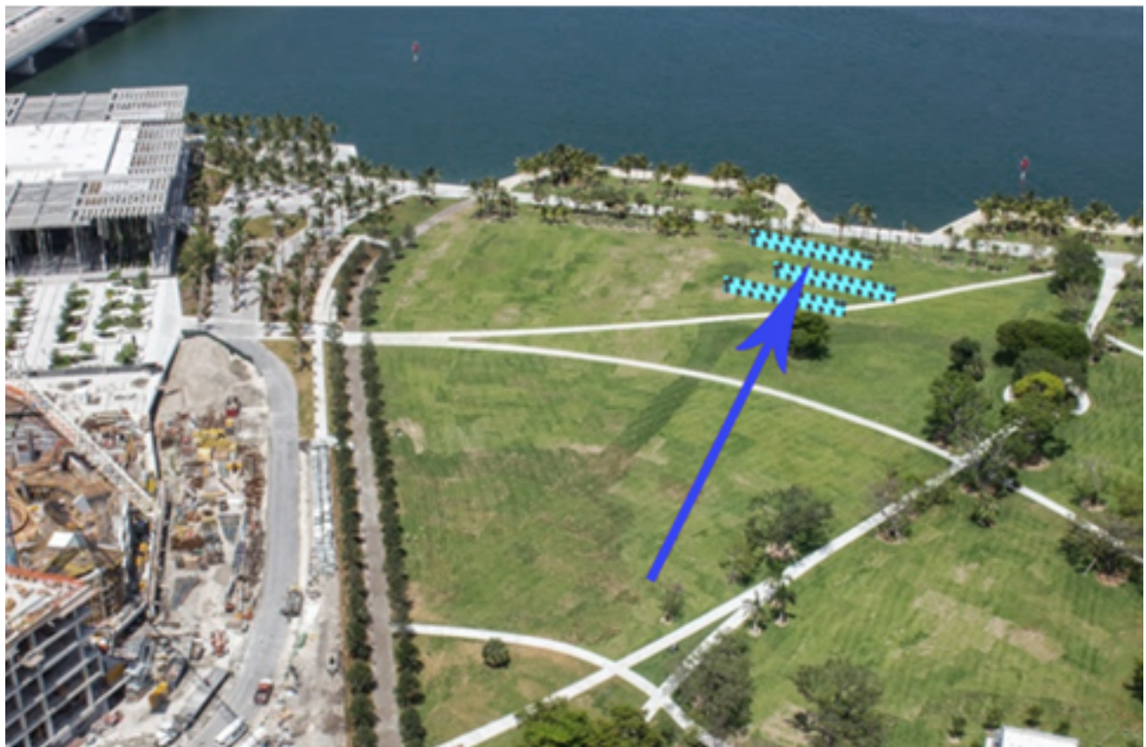
Below: Location of three billboards with sight lines.