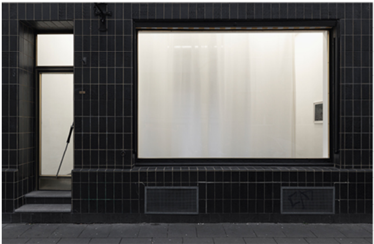
Exterior view of installation at Clages, Cologne, Germany.