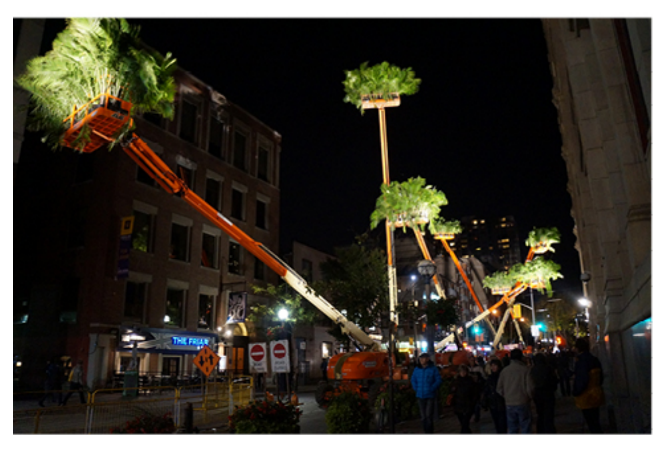
Installation along Queens Street on the occasion of Nuit Blanche, Toronto, 2014