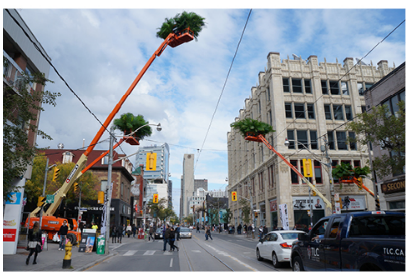
Installation along Queens Street on the occasion of Nuit Blanche, Toronto, 2014