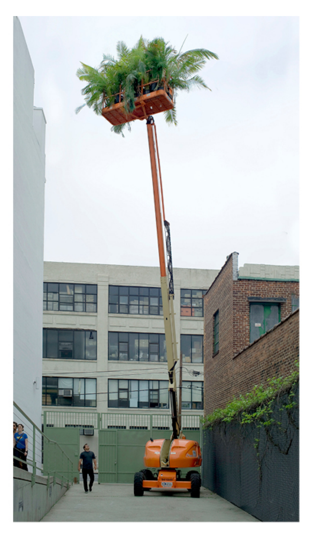
Installation at Fischer Landau Center