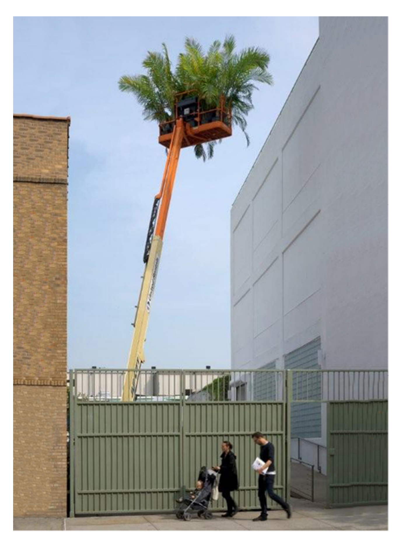
Installation at Fischer Landau Center