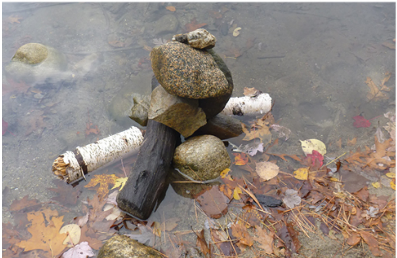
(Top) Walden Pond State Reservation Plaque (Bottom) Chainsaw cut wood under rock pile at Walden