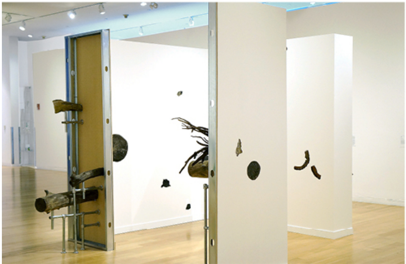
Installation views and details