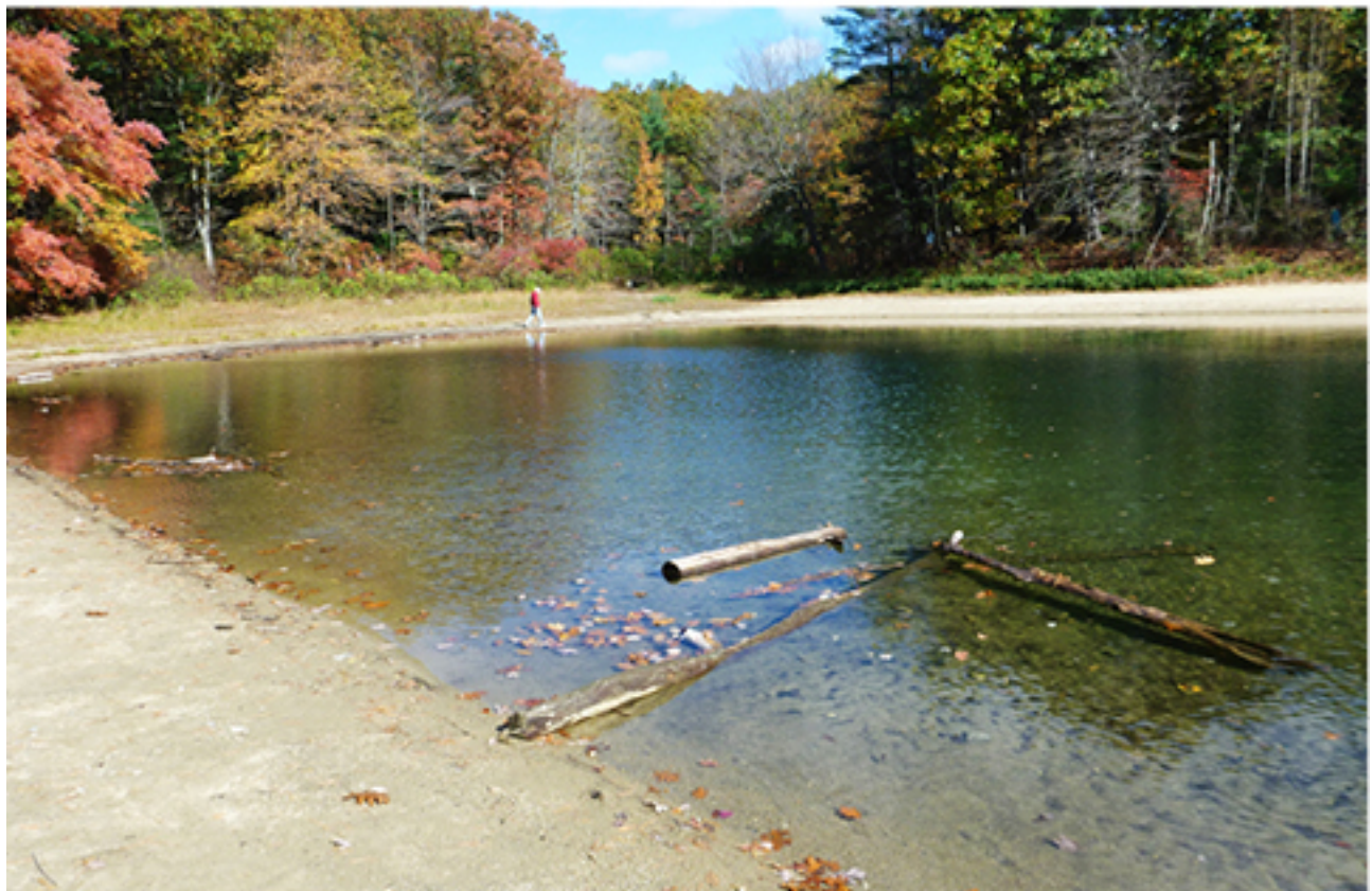
Walden Pond, October 2014; Northwest corner of Walden Pond with floating chainsaw-cut samples later collected.