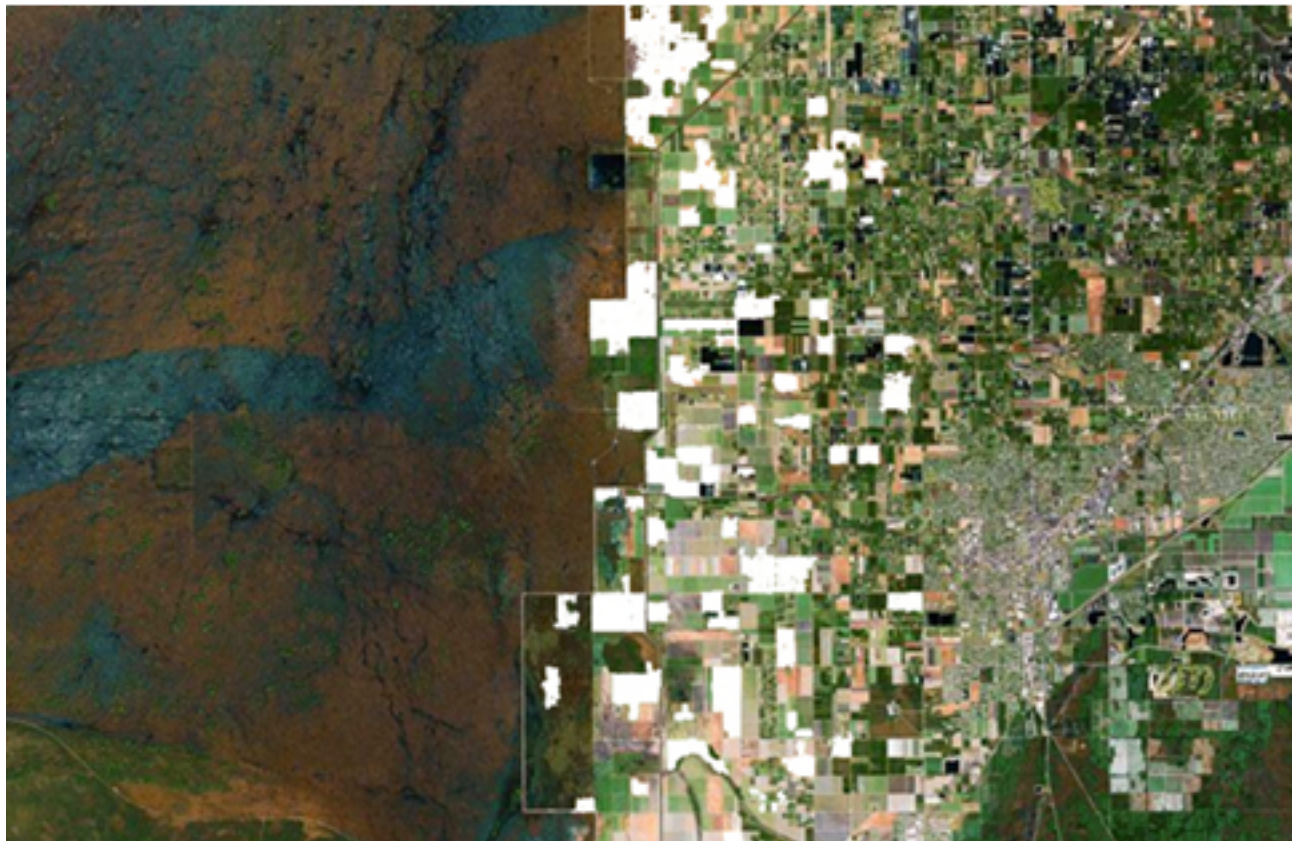
Aerial view of the Urban Development Boundary Line separating Miami from the Florida Everglades